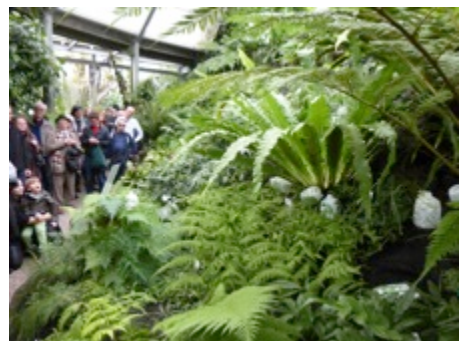
Ron den Daas's ,Native Plant' installation in glass house