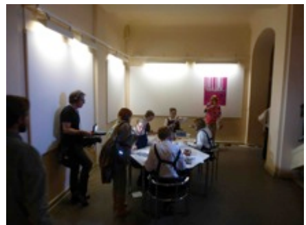
View of Foreign Investment performance Sky Mile