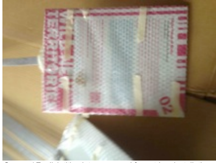
German/ English title plates prepared for outdoor installations