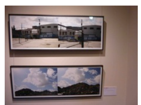
Bo Myer's Excavate ii and iii