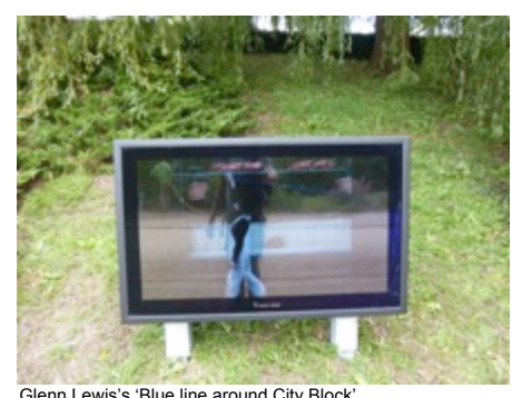
Glenn Lewis's 'Blue line around City Block'