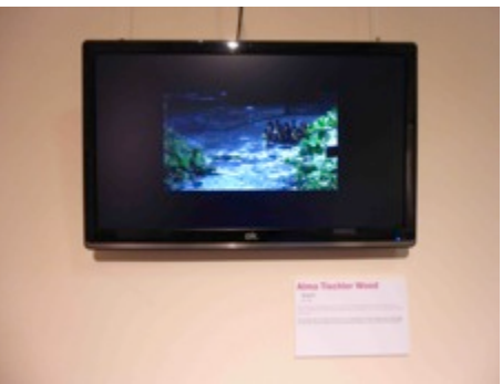
Alms Tischler Wood's 'Quack'