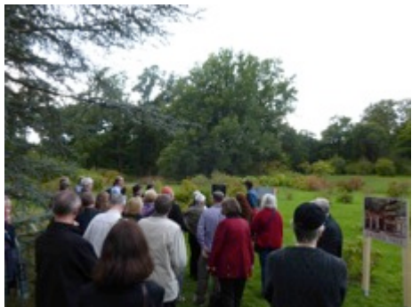
The audience is introduced to Glenn Lewis's 'Survival Paradise'