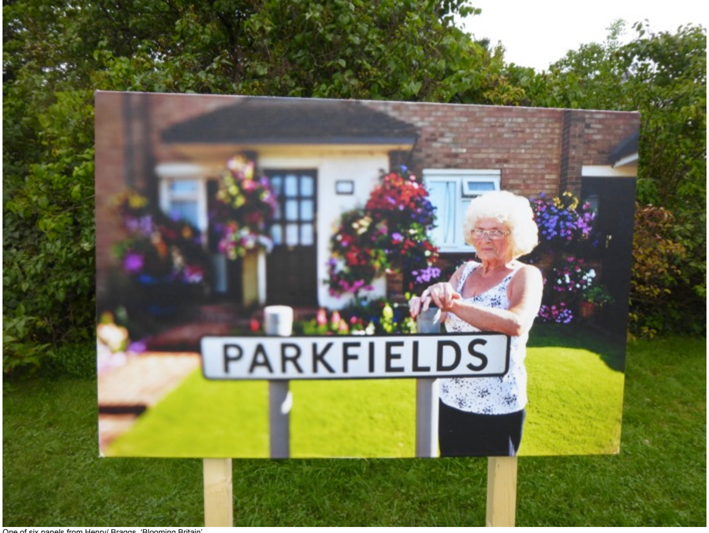
One of six panels from Henry/ Braggs, 'Blooming Britain'