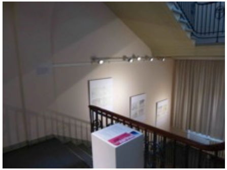
Foreign Investment's 'Sky Mile' installation in staircase