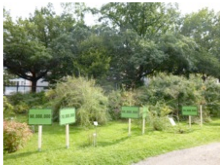
Edgar Heap of Birds, 'Ending Native Lives or Money'