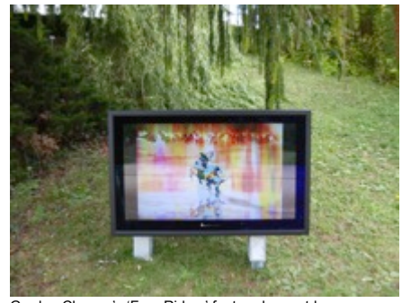
Gordon Cheung's 'Four Riders' featured on outdoor screens