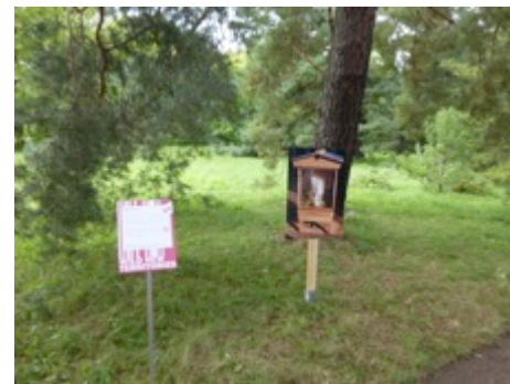
Beehive' in garden close up