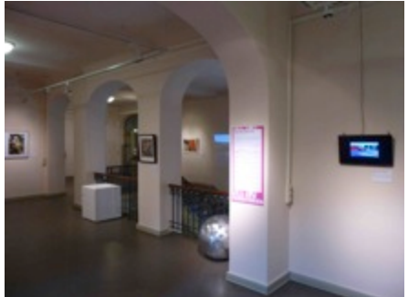
Gallery Installation view