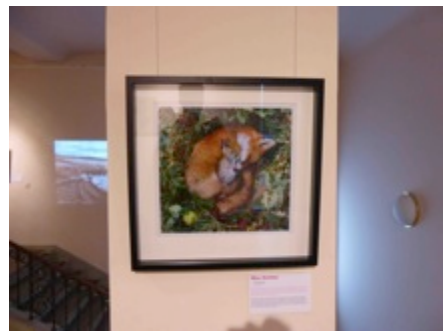
Max Kimber's 'Foundling'