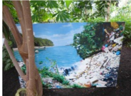
Mar's Kaliszewski's 'organic' installed in glass house