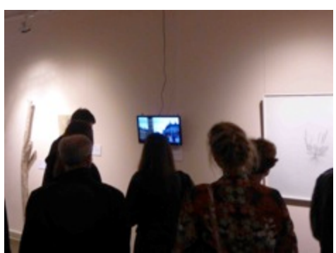
WNT opening reception