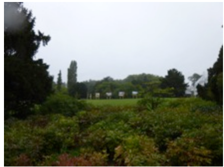
Different views of Henry/ Bragg's 'Blooming Britain', installed in front of main glass house