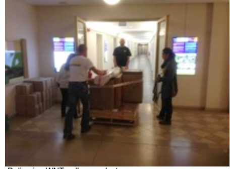
Delivering WNT gallery works to museum