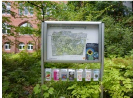
Cornelia Wyngaardens twelve text panel 'Philosophers walk' is featured on the 'Haupstrasse' leading to the glass houses from the museum 30,000 WNT brochure/ maps were printed for exhibition