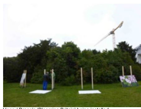
Henry/ Bragg's 'Blooming Britain' being installed