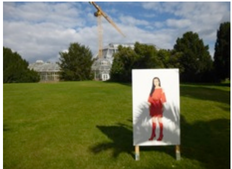
Close up of one panel