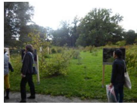
The works resonate well in the diverse plant collection of BMBG